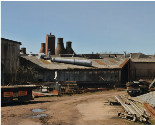
First prize junior category winner: A member of the Youth Landscapers Group

Along with their visit to the Showroom, they also went to other buildings in the area with the recordings now making up part of the Moira Furnace audio trail.